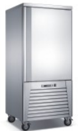
TEN PANS BLAST FREEZER