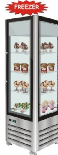
ANGEL-500 (F) (FOUR SIDE GLASS)