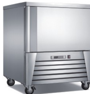
FIVE PANS BLAST FREEZER