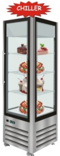
ANGEL-500 (C) (FOUR SIDE GLASS)