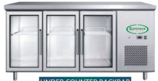
UNDER COUNTER BACKBAR