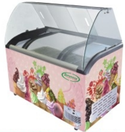
SCOOPING PARLOUR 14/21 F